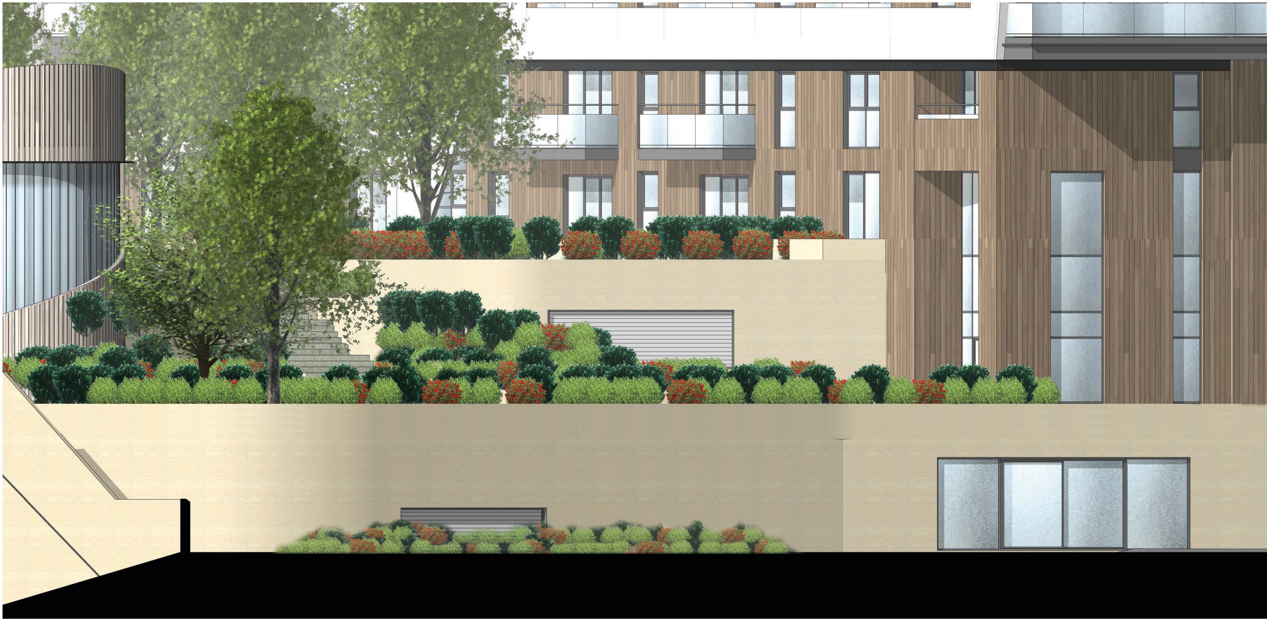
1 Leisure Unit 2 Elevation 730 Scale - 1 : 100

Notes: • All drawings are subject to Planning and Building Control consent. • The details shown are for design intent purposes only and are subject to further design development with suppliers and sub-contractors • Proposals subject to consultation and approval from Local Authority Building Control or an Approved Inspector • All setting out dimensions should be checked on-site prior to construction and any discrepancies and/or omissions should be reported to the Architect immediately